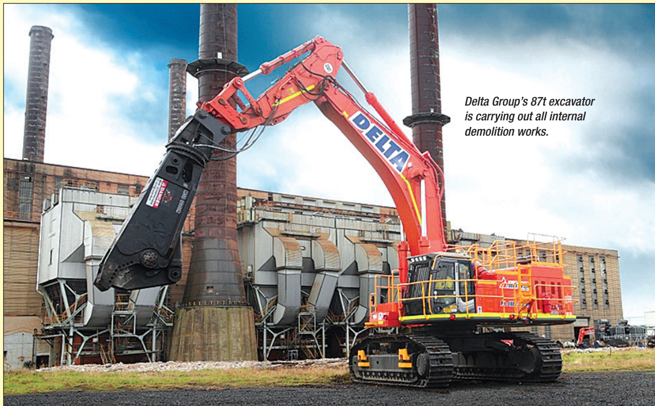
Delta Group's 87t excavator is carrying out all internal demolition works.